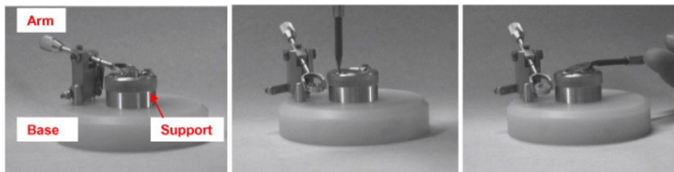
Figure 1: Illustration showing the basic steps 1 through 3. The sample holder is inserted into the special mounting tool and tightened in place.